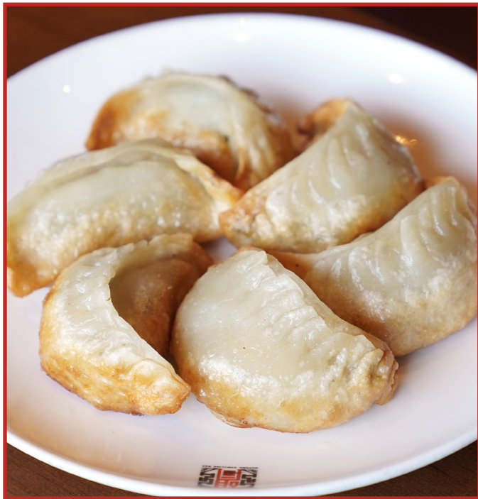
Pan-fried Dumplings(8 Pieces) 生煎锅贴 (8 个) 🍲