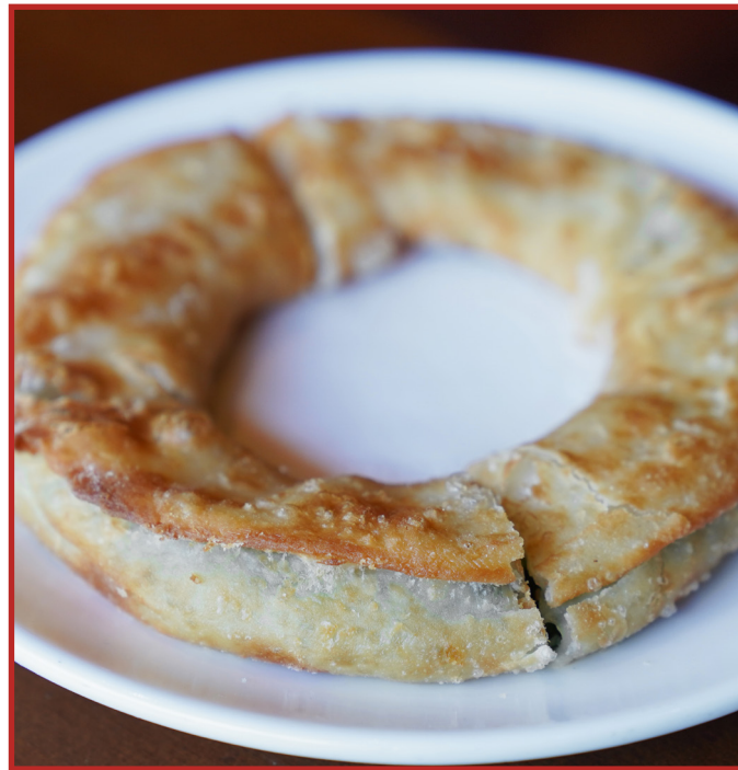
Spring Onion Pancake 葱油饼 🍲