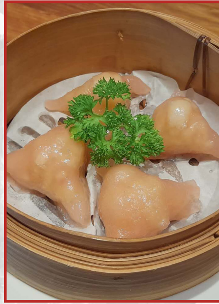
Crab Meat Dumplings with Beetroot (4 Pieces) 红菜头蟹肉饺 (4 个) 🍲