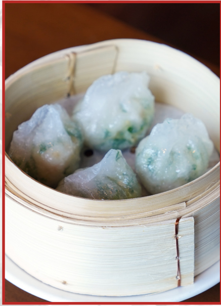
Steamed Garlic Chives Dumplings with Minced Prawn(4 Pieces) 韭菜饺 (4 个) 🍲