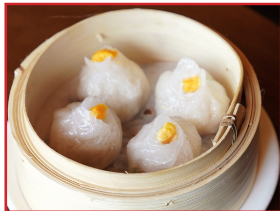
Steamed Prawn & Crab Minced Dumplings (4 Pieces) $13.80 蟹肉水晶包 (4个) 🍲