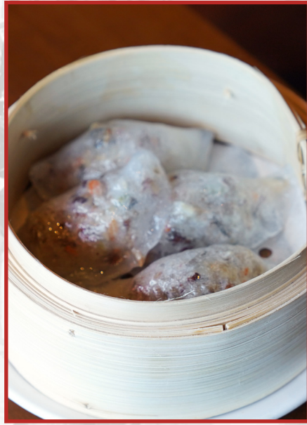
Duck Dumplings (4 Pieces) 鸭肉饺 (4 个) 🍲