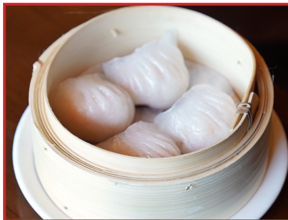
Prawn and Bamboo Shoot Dumplings(4 Pieces) $13.80 笋尖鲜虾饺 (4个) 🍲