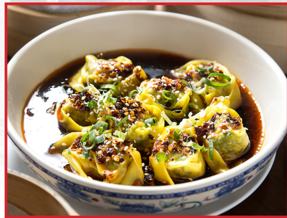
Wontons with Hot Chilli Sauce $14.80 (8 Pieces) 红油抄手 🍲 🌶️ 🌶️