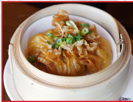
Prawn Dumplings (4 Pieces) $13.80 港式虾饺 (4个) 🍲